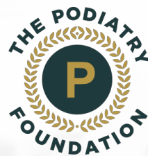
Exhibit Booths Visit & Win Prizes!

Stop by the exhibit booths to explore and learn about new innovations, products and services from top industry members. For every booth that you visit, you will receive a ticket to enter your name into drawings for a variety of prizes!